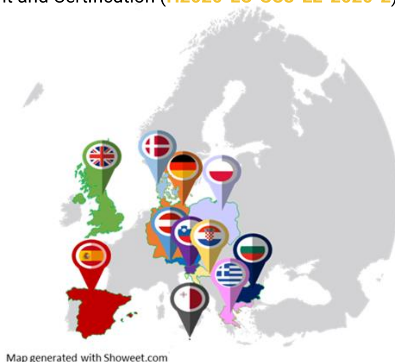
Map generated with Showeet.com